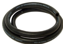
107446 Re-enforced EPDM discharge hose 2.5 metre x Ø19mm i.d.