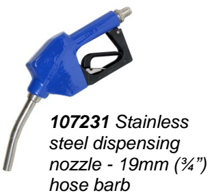
107231 Stainless steel dispensing nozzle - 19mm (¾") hose barb