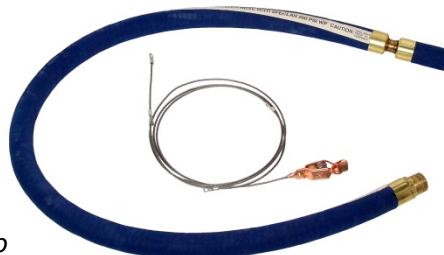
107429 Static protection kit – includes 1.2m polyethylene grounded hose with ¼" NPT brass fittings, ground wire and clamps; for use when pumping flammables. Use an air motor and stainless steel tube set