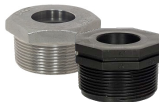
CW539 Barrel bung Polypropylene