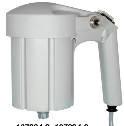
107324-2, 107324-3 Electric Motor