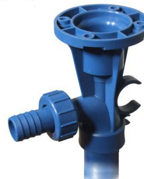
DEFP003 & 004 Polypropylene tube set