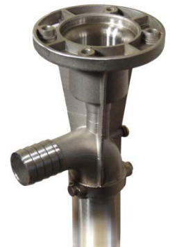
DEFS003 & 004 316SS tube set