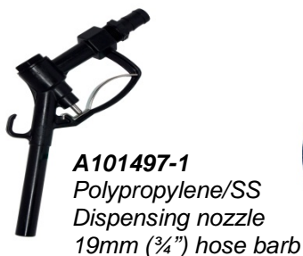
A101497-1 Polypropylene/SS Dispensing nozzle 19mm (¾") hose barb