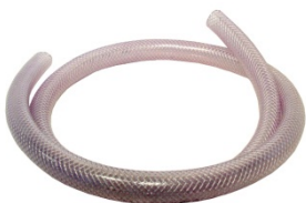
107435 Re-enforced PVC discharge hose 1.5 metre x Ø19mm i.d.