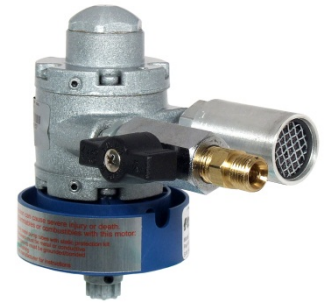
107325 Air Motor